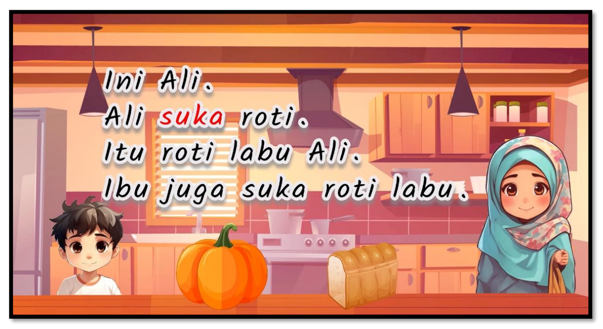
Figure 1 Spacing and color contrast in dyslexia-friendly ebook

As part of the project, dyslexia-friendly ebooks that include a variety of features will be utilized to enhance the readability and accessibility of the material for dyslexic readers. According to McTigue et al. (2015), the features may include the ability to customize font sizes, spacing, and color contrast in order to accommodate to the tastes and requirements of both individuals and the visual environment. According to Henningsson et al. (2019), the implementation of text-to-speech technology will be implemented in order to provide assistance with word recognition and comprehension. Enhanced engagement and facilitation of multimodal learning will be achieved by the incorporation of interactive features such as audio narration and synchronized highlighting, as stated by Schroeder et al. (2018). The ebooks will be selected from reputable publishers and will be carefully selected to ensure that the content is appropriate for the age group that is intended to read them and that they are readable. Refer Figure 1.