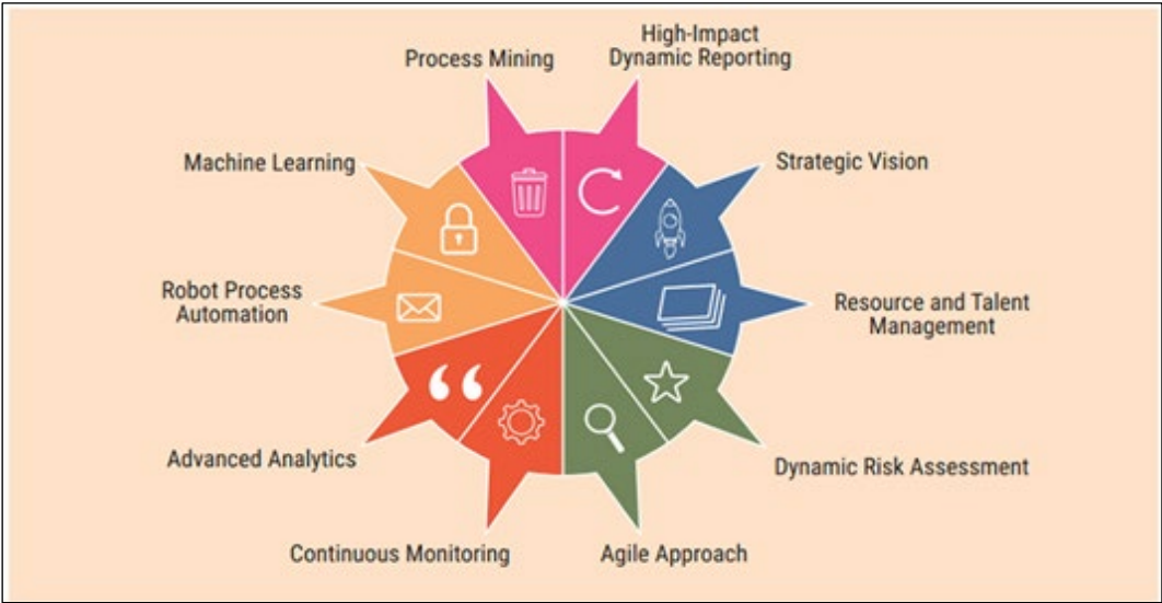
Figure 2. Elements of Future Audit

In general, this research enhances the comprehension of the consciousness and execution of digital audits in Malaysia, providing significant perspectives and suggestions for public auditors and accountants. The Malaysian auditing profession can effectively adapt to the digital era's dynamic landscape by embracing digital auditing and implementing requisite technologies and practices.