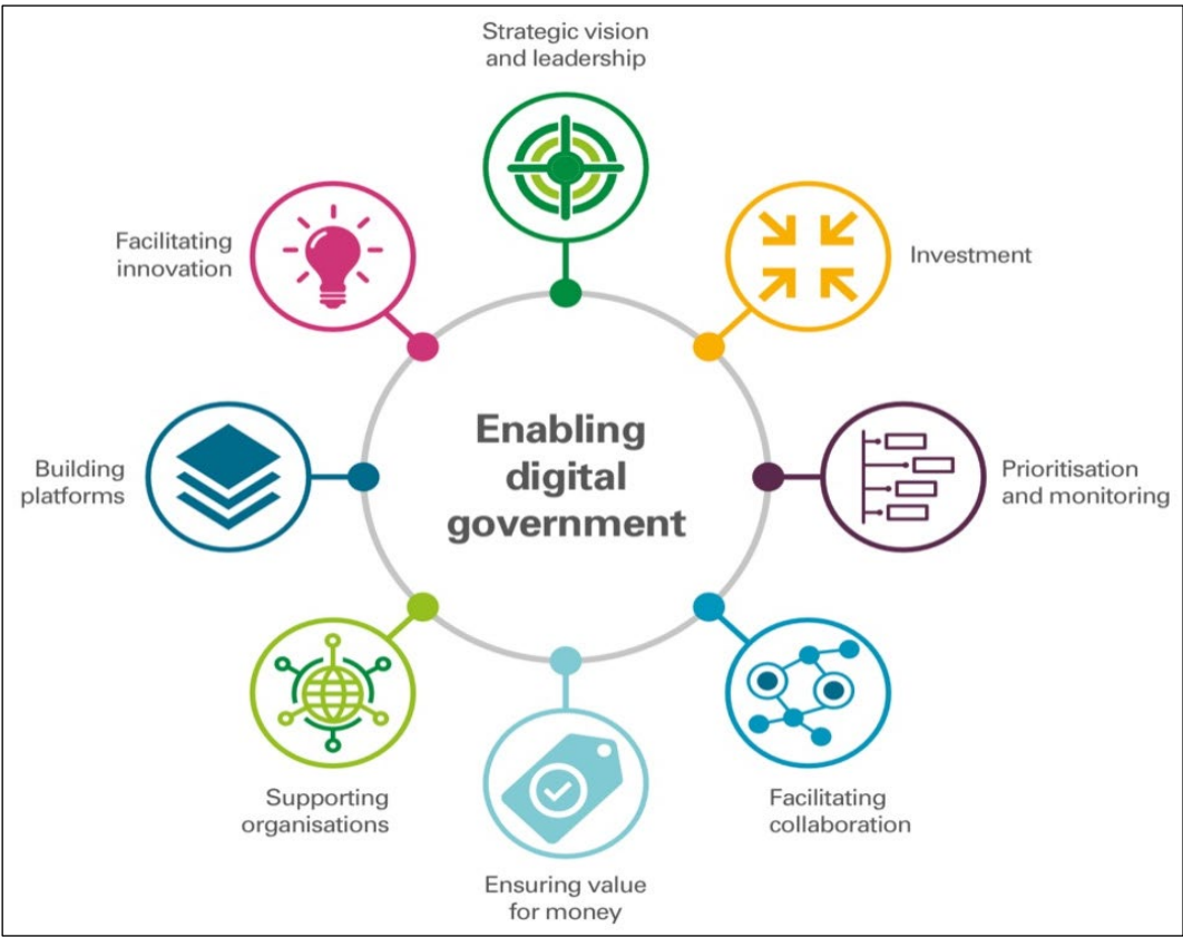
Figure 3. Enablers of Digital Government