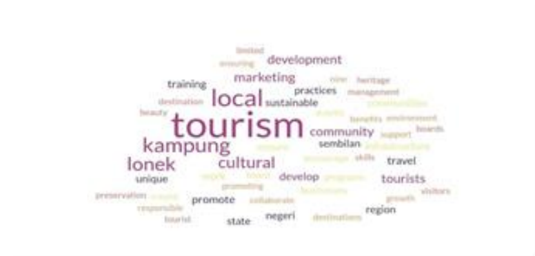
FIGURE 2: WORD CLOUD

In Kampung Lonek, the theme of technology manifests in several intriguing ways, reflecting a dynamic fusion of traditional values with modern innovations. Here are some key findings and discussions regarding the technology theme in Kampung Lonek: