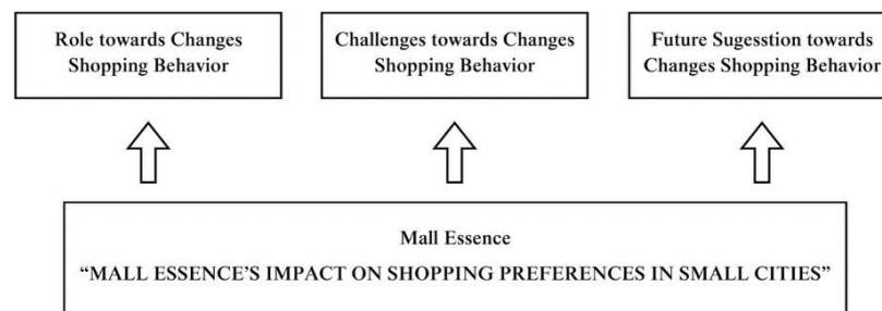
Figure 1: Research objectives of the proposed study

The interview questions are created by reviewing previous literature and article aligning them with the research objectives of the study: